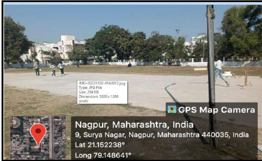
Surya Nagar Corporation Ground

Our college organized an Inter college one day Cricket Tournament on 01-02-2024. There were many students who participated in cricket. Students who had gathered in the playground to cheer their respective teams. After the tough competition B.Com-II students lift the trophy.